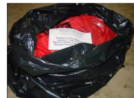
Figure 2 Proper autoclaved waste disposal