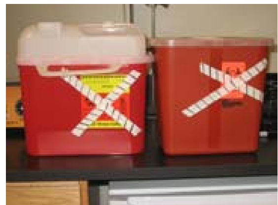
Figure 1 Autoclave tape utilizes a chemical reaction to indicate a temperature of greater than 121°C was achieved. This color change is usually displayed with hash marks or words that appear on the tape when the proper temperature is reached.