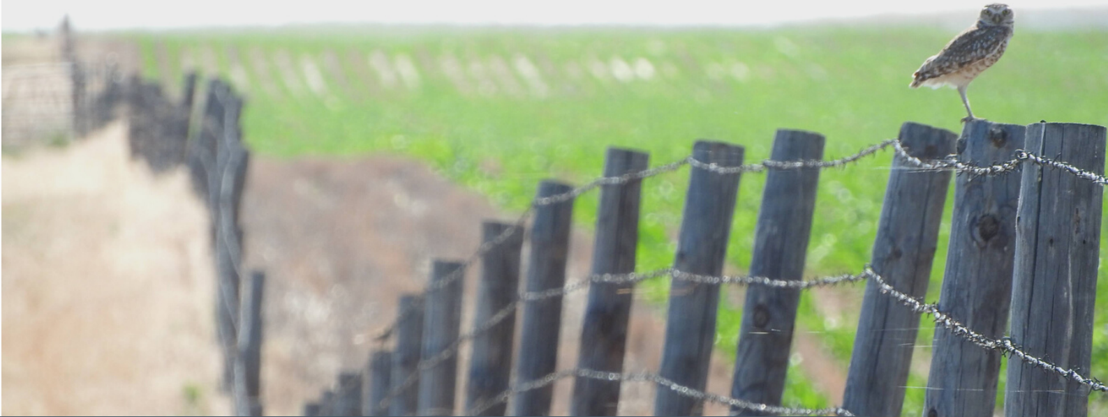
Above: Burrowing Owl near the prairie dog town at Cedar Point, June 22, 2022. Below right: Cedar Point skink sticker, design by Katie Nieland - stickers available!