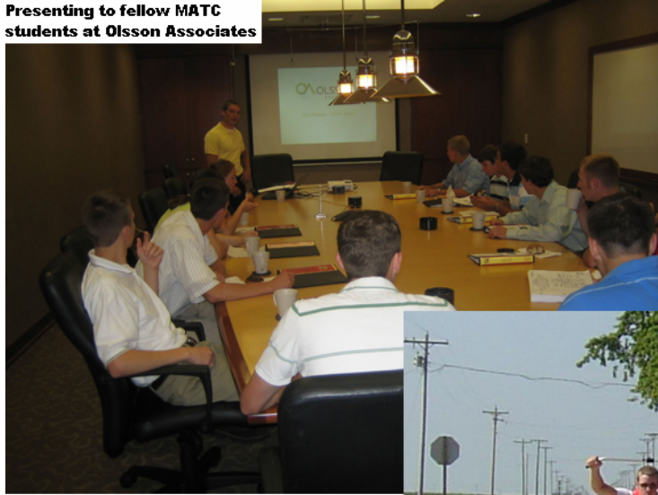
Presenting to fellow MATC students at Olsson Associates