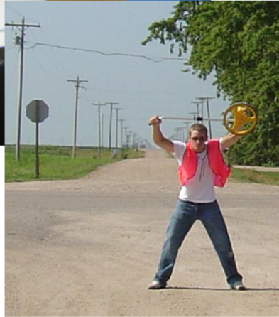
On a data collection trip to Aurora, NE . . . having a little fun too!

This summer has proved to be extremely valuable in my growth as a future civil engineer. I have learned about the workings of the engineering community, gained knowledge about various traffic engineering software, broadened my knowledge of what firms exist in the area, as well as gained employment as a student technician, to continue working at Olsson Associates throughout my undergraduate career. I have decided to pursue a career in traffic engineering after graduation, and am very pleased I applied to be a MATC intern this summer.