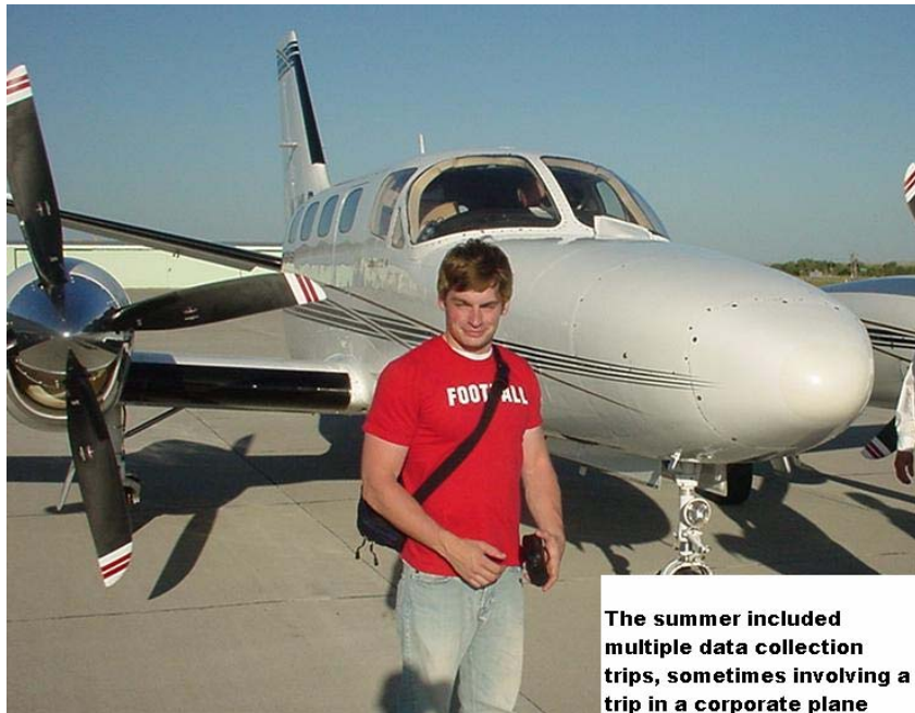
The summer included multiple data collection trips, sometimes involving a trip in a corporate plane

As the weeks ensued, I continued working in Microstation, expanded my Microsoft Excel knowledge, and learned Synchro, to obtain traffic capacity