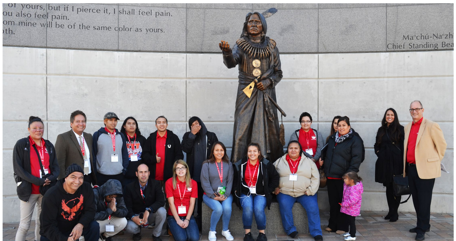
2018 Scholars Program participants at the Chief Standing Bear statue in Lincoln, NE.