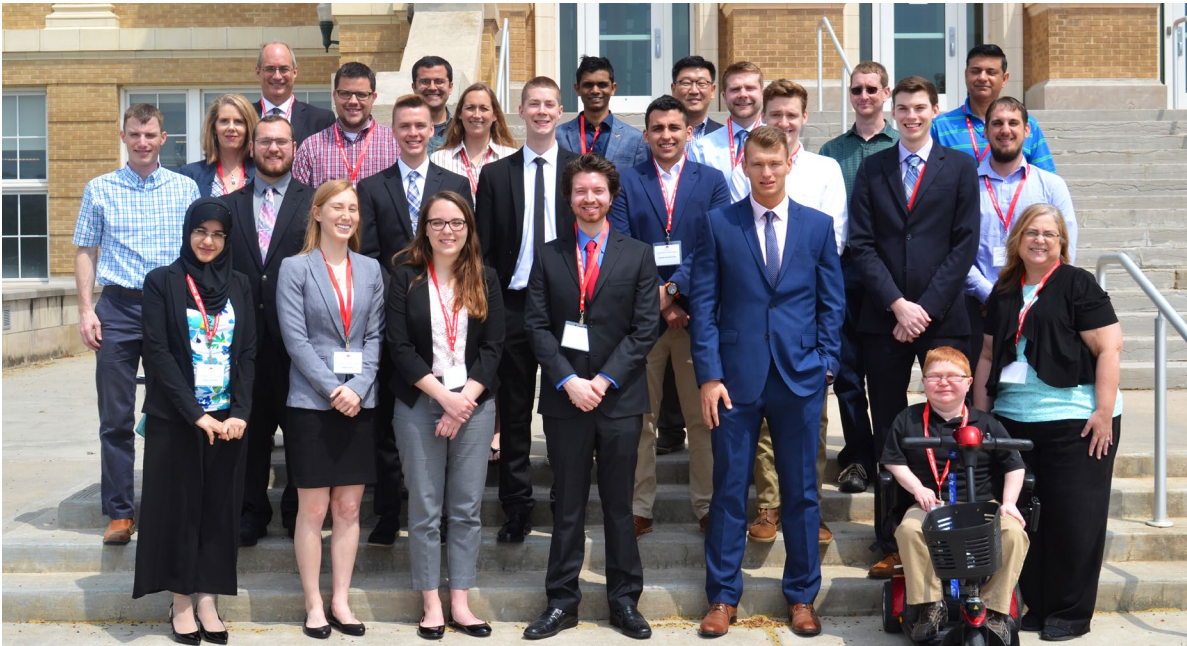
The 2018 interns and sponsors gather together for the orientation meeting.