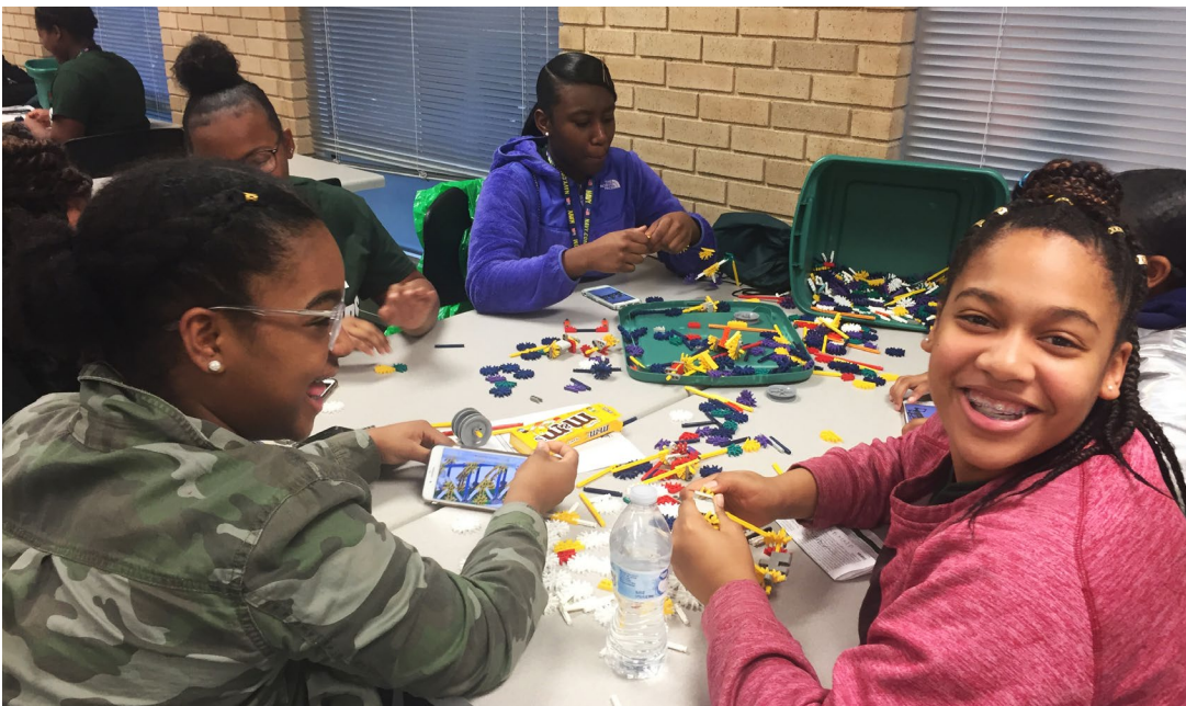
Bottom: Missouri high school students engage in a hands-on bridge engineering competition at S&T during NSBE PCI Weekend .