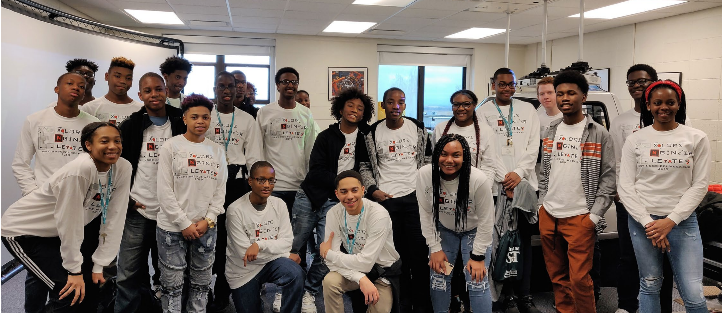
Top: Student leaders from S&T's NSBE chapter and Missouri high schoolers visit the university's Virtual Reality Driving Simulator.