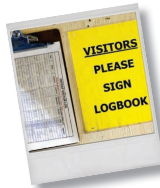
A visitor log or guest book can be used to track human movement in the event of a disease outbreak

Where might you make changes to accessing your farm, barn and horses?