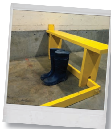
A simple crossover station at the entrance and exit to isolation. Physical barriers serve to remind people to change footwear, outwear and wash hands prior to entering and upon exiting quarantine and/or isolation