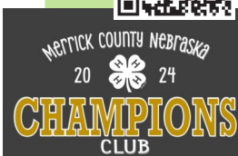
Image of a 4-H Clover

STEP 3. MUST INCLUDE: 'Merrick County' 'Champions Club' '2025'