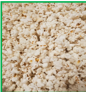
Gourmet White- Half Salt