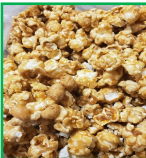
Popcorn Peanut Brittle