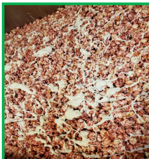
Raspberry Cream Cheese