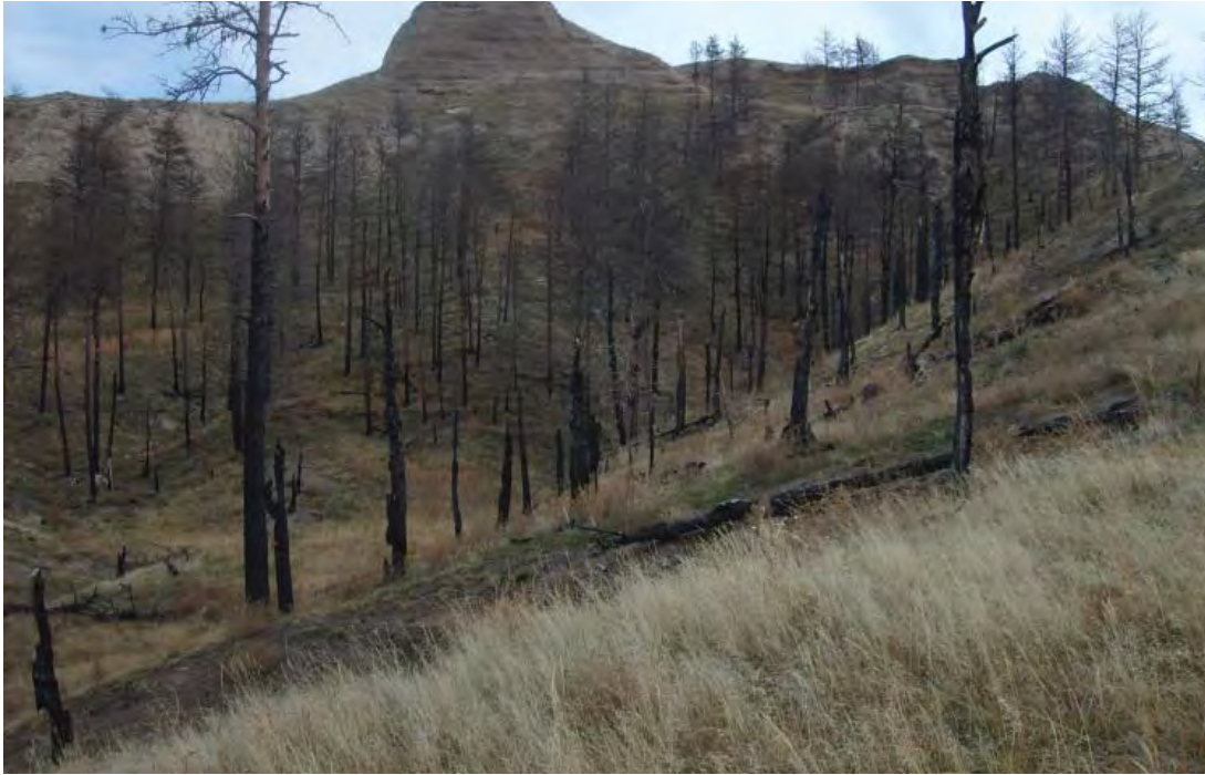
Pine Ridge, Roberts Track, 2013