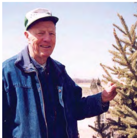
Prairie Pines Falls