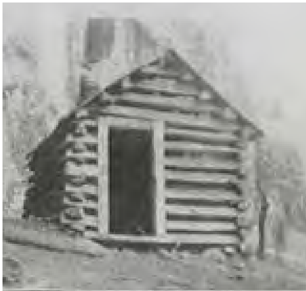
Forestry Club clubhouse

In 1909, the club began publishing a Forest Club Annual. “This book,” they wrote in 1910, “will contain articles on technical and practical forestry written by our student members and alumni, and is intended to be made up almost wholly of individual student articles ... In doing this work we are influenced strongly by the fact that many valuable and interesting observations are rendered non-available to foresters and forestry students because