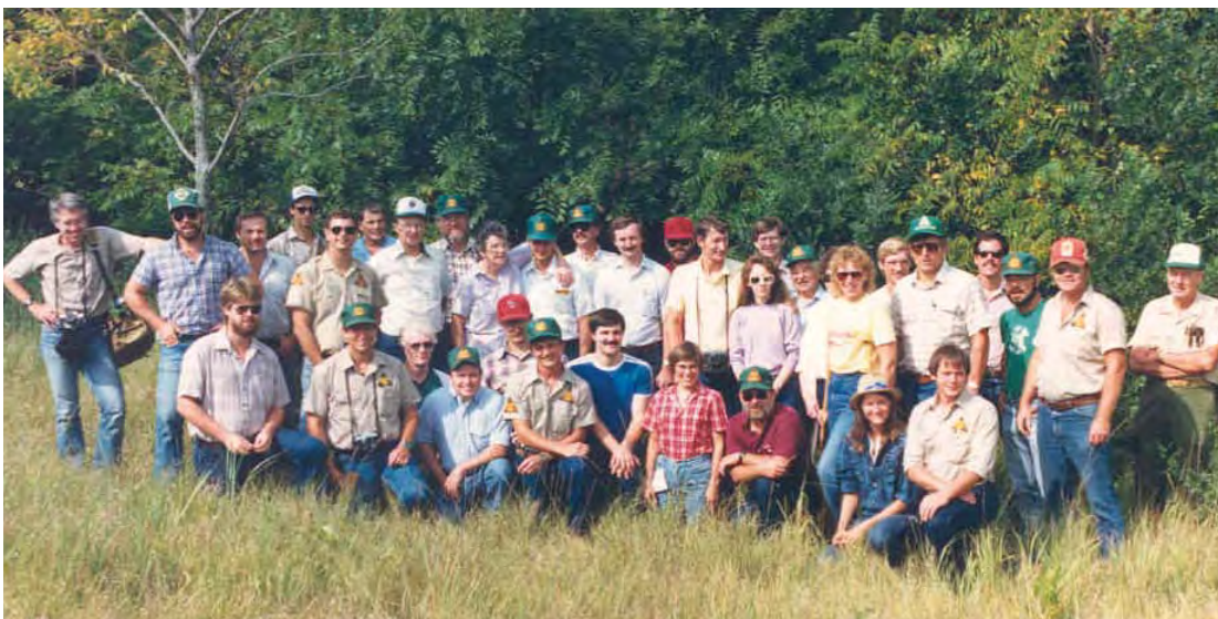
Nebraska's Forestry, Fisheries, and Wildlife Staff, 1985