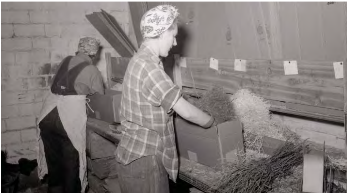
Work at the Plumfield Nursery, PSFP era