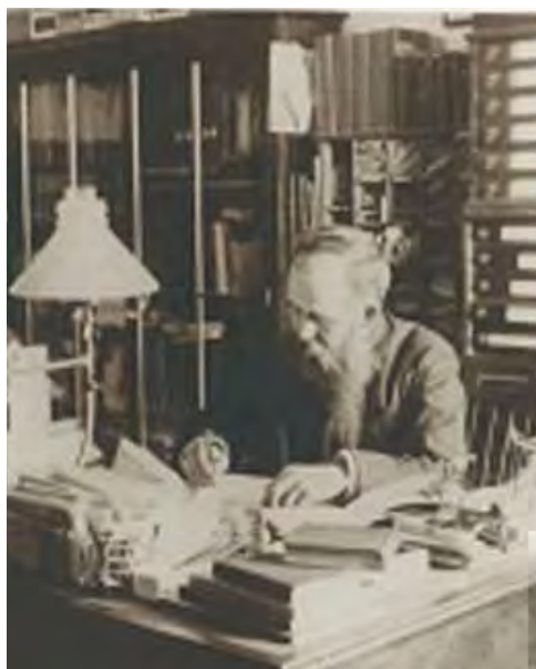
Charles Bessey, Professor of Botany and Horticulture