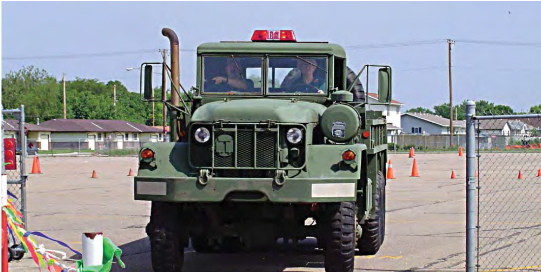
Federal Surplus Equipment being transported to its new home in Mead