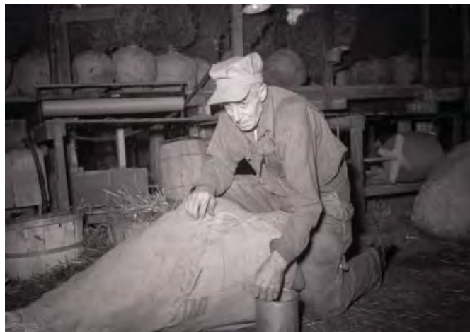
Plumfield Nursery Worker, PSFP era

Archives and Special Collections, University of Nebraska-Lincoln Libraries