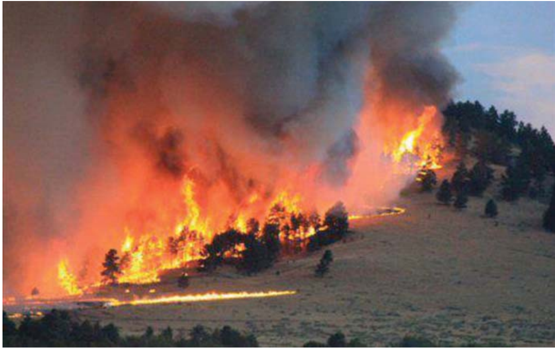
Fire devastates the Pine Ridge, 2012

To better inform the University and the Unicameral of the accomplishments of NFS programs and activities, and to reduce the chances of the service being a convenient budgetary target, one of Josiah's initiatives was to begin publishing annual reports. This was a prescient decision, as the pages of these reports would document a period when the NFS changed from a behind-the-scenes organization to one that visibly engages with the public and collaborates with numerous programs and citizens across Nebraska.