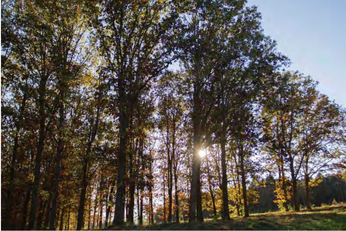
Red oak stand at Horning State Farm Demonstration Forest, 2016