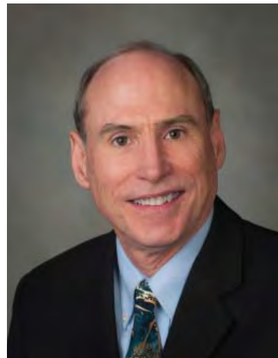
Nebraska Forest Service