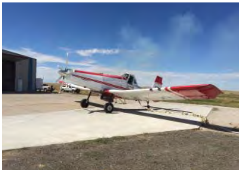
Single Engine Air Tanker (SEAT) readies for an aerial assault on a fire in 2015

Josiah and the NFS soon faced challenges in the new millennium that would devastate sections of Nebraska in a manner reminiscent of the harrowing days of the Dust Bowl. The increasing frequency and severity of droughts—combined with a growing amount of forest fuel—led to enormous wildfires burning large areas of the Pine Ridge forests in 2006. During a particularly deep drought in 2012, huge fires burned with off-the-charts intensity, costing the state and landowners tens of millions of dollars. These repeatedly catastrophic wildfires reduced the Pine Ridge from 250,000 acres of forest in 1994 to 90,000 acres by the end of 2012. Another severe fire season would put at risk the very survival of the remaining pine forest ecosystem in the Pine Ridge.