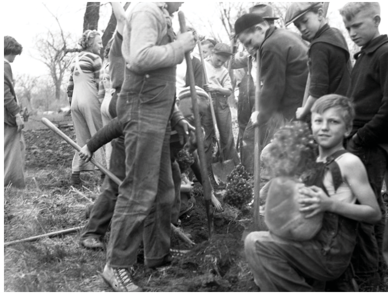
4-H club members plant trees during the Dirty Thirties