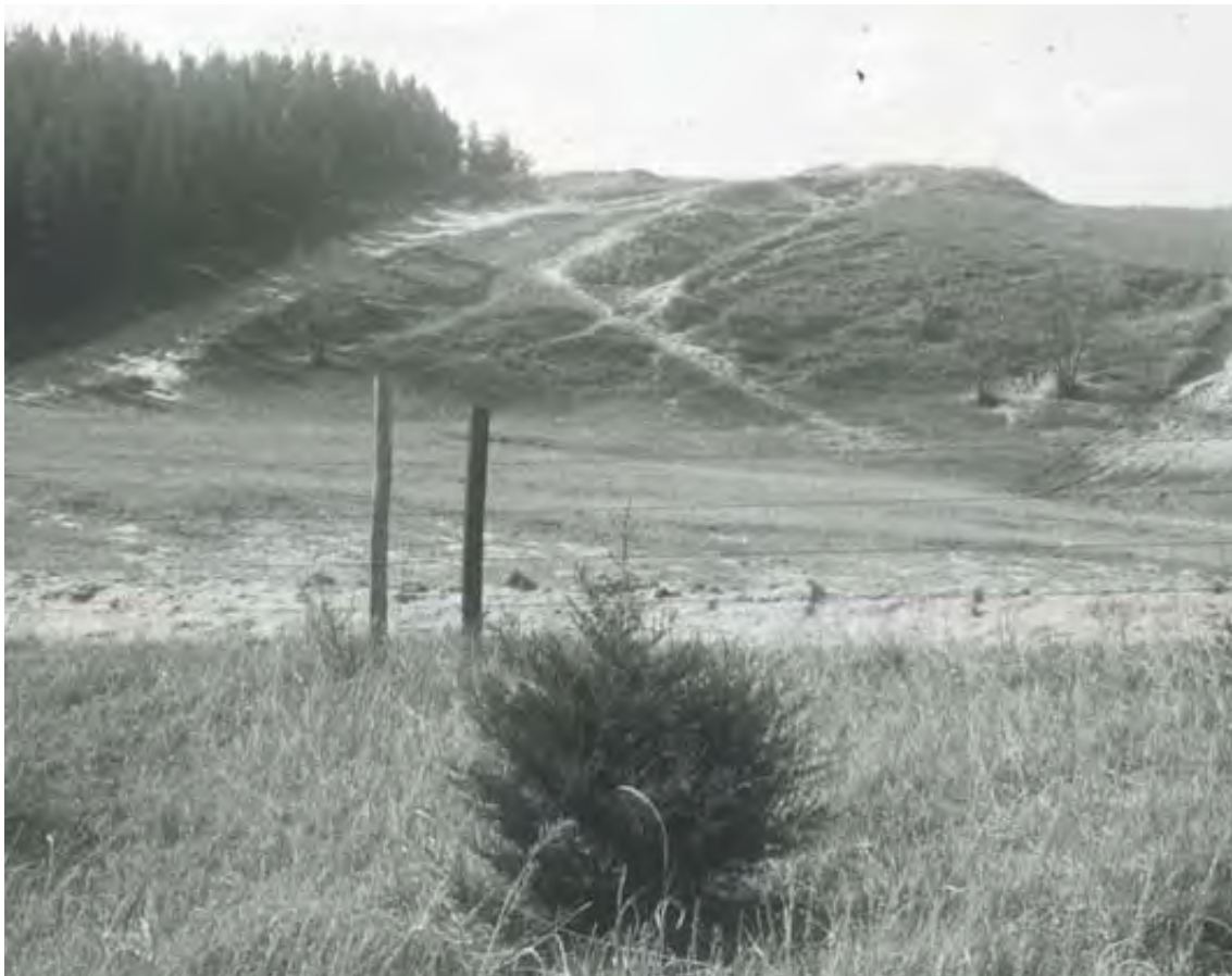
Nebraska National Forest, circa 1900s