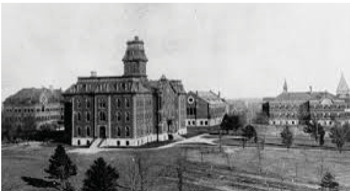
Nebraska Hall, circa 1910s

the Department of Horticulture used funds from the Weeks Act of 1911 to create an extension position in 1915 that would assist with these needs. 1 The Extension horticulturalist position was charged with sharing his knowledge and experience and with “imparting information on forest trees.” 2 This was a far cry from the previous decade of forestry activity, but at least residents had one contact person at the university to answer their questions. In addition, the “farm forestry” course reappeared in the College of Agriculture bulletin of 1920-1921 under the Department of Horticulture. 3 These courses taught the principles of windbreaks and woodlot creation which the former Forestry Department had pioneered. Despite the demise of the Department of Forestry, the importance of its accomplishments to the productivity and preservation of the Nebraska landscape demanded attention.