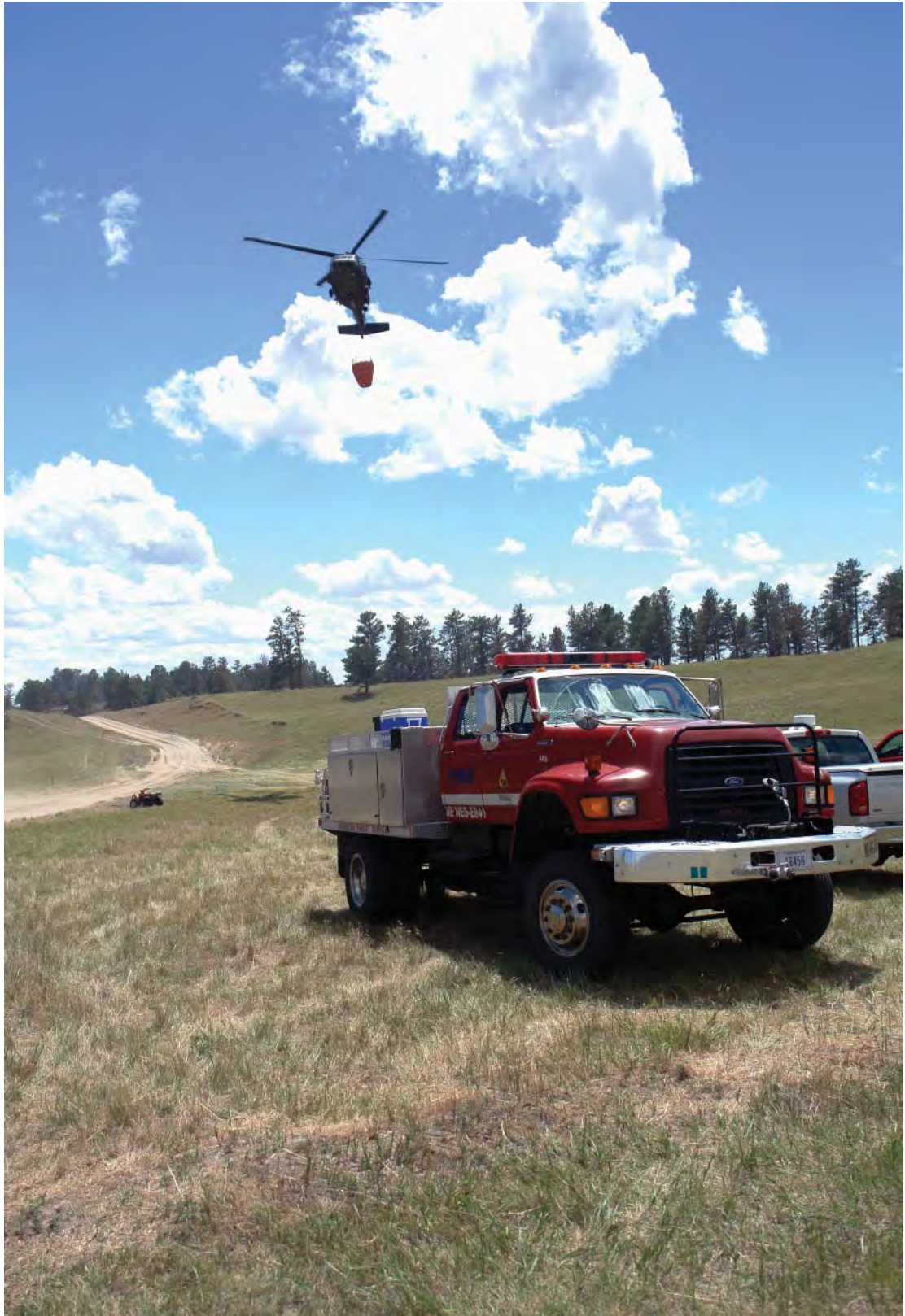
Aerial support battling June 2012 Cottonwood Fire