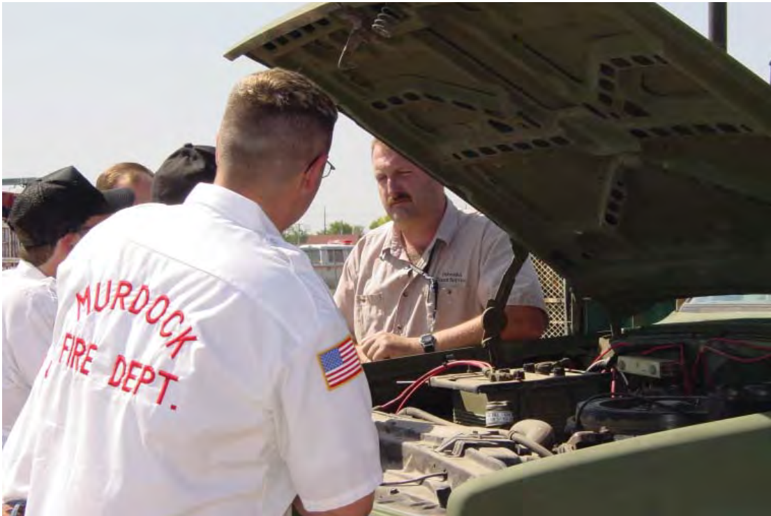
Forestry field day, 1981