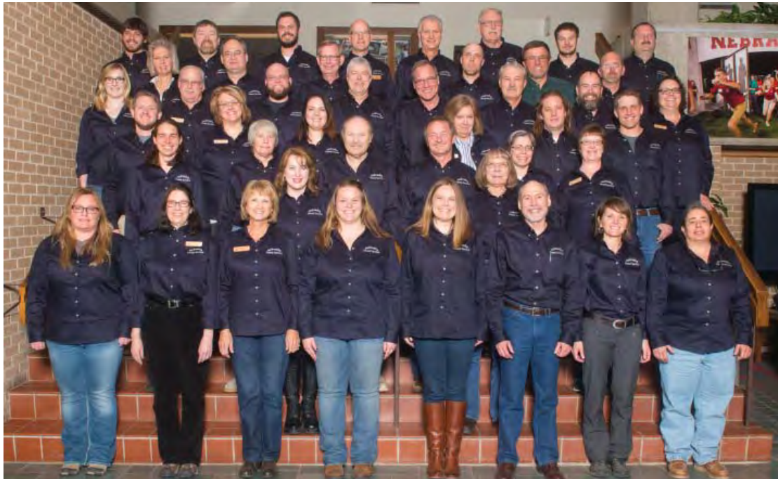
Nebraska Forest Service

The dedicated staff of your Nebraska Forest Service, 2016 (fom left to right):