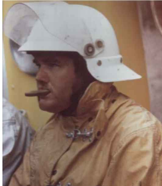
Nebraska Forest Service