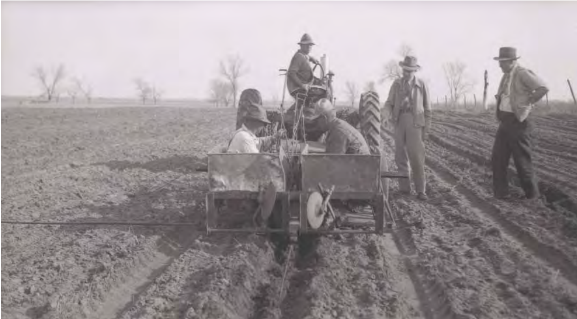
Tree planting project, PSFP era

uous 100-mile wide shelterbelt crossing from North Dakota through Texas. Towns would have to be moved, farmsteads would be sliced apart. “The plan is fantastically impossible,” reported the Journal of Forestry . “The whole enterprise, prominent as it is in the public mind, bids fair to prove a boomerang which will give forestry a terrific setback in public opinion.” In actuality, the Shelterbelts were never intended to be continuous, and they would only be placed along public lands and cooperating farmsteads. “It is not an undertaking in which slipshod methods will succeed,” wrote the senior silviculturist for the U.S. Forest Service in 1934. “It represents a challenge to the technical skill of the profession and will require that our coming foresters develop a technical skill and a love for the soil which has not been much in evidence in the past.” 10 These technical skills, many of them pioneered in Nebraska, were evident to Chief Forester Silcox as he visited a farmstead. “We stopped at one of the old windbreaks,” he recalled in 1938, “where trees 80 to 90 feet tall were sheltering a cornfield. We walked out into that cornfield for a thousand feet before the wind became strong enough to bend the tassels. The sheltered corn was estimated to yield as much as 65 to 70 bushels an acre. Yet in part of the same field where there was no tree protection, the corn had been burned brown and dry by a hot wind.” 11