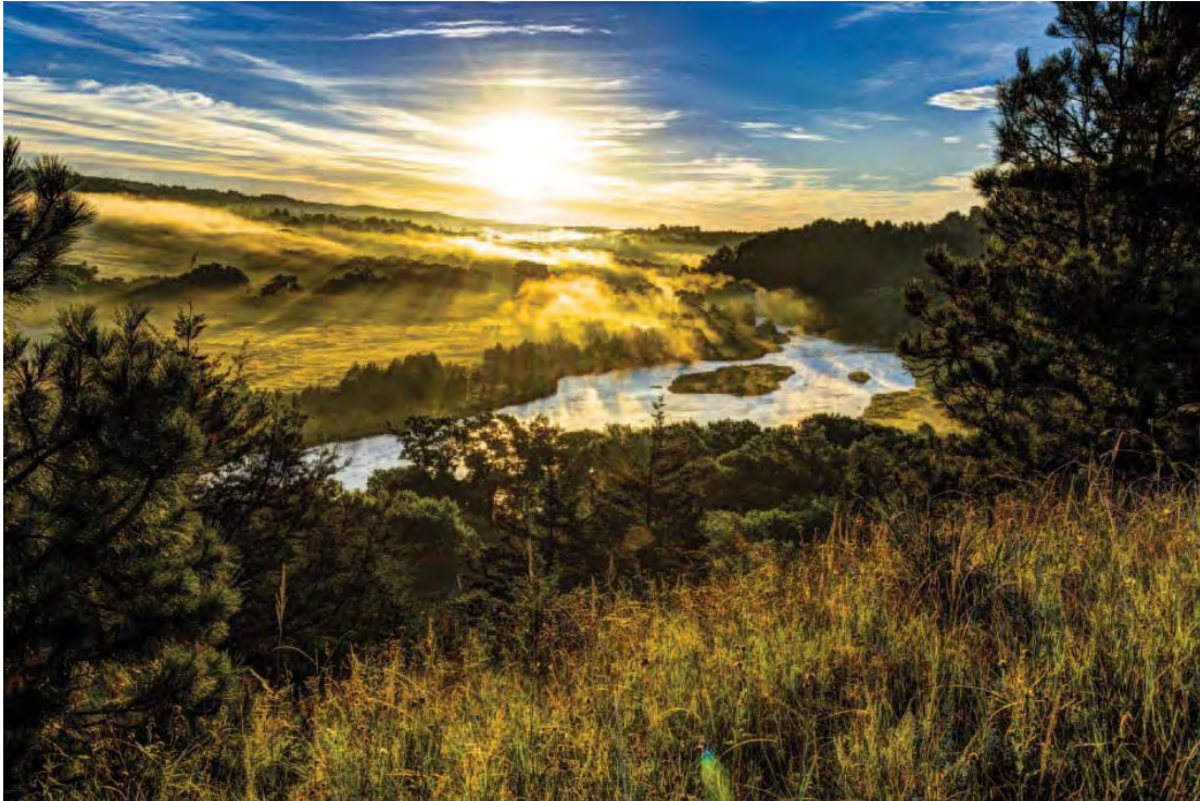
Sunrise at Chat Canyon Forestry and Wildlife Management Area, 2013