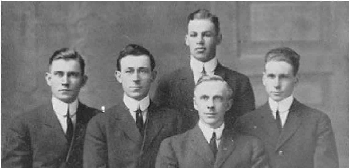
Forestry Club annual staff, 1913