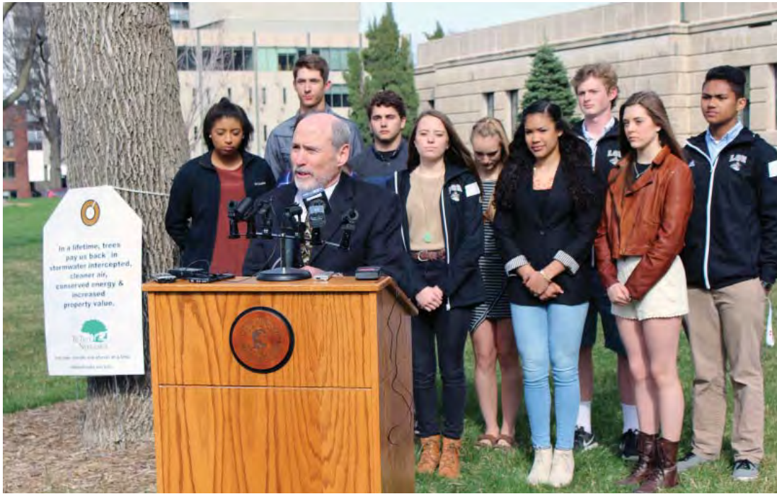
Nebraska Forest Service