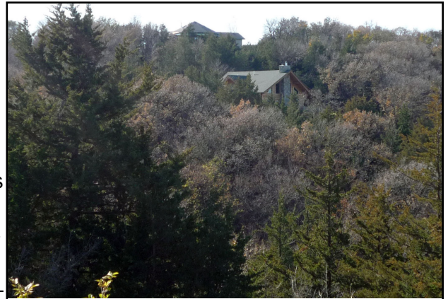
Homes like these in the Devil's Nest region of Northeast Nebraska should take necessary precautions to avoid potential loss in a wildfire.

The Nebraska Forest Service is working with communities across the state to prepare Community Wildfire Protection Plans to help local officials, fire departments, and residents prepare for wildfires. These plans are tools for addressing the challenges and responsibilities that arise from living in a wildfire-prone environment. Local residents and a planning team define wildfire risk areas within and adjacent to communities, the measures necessary to mitigate those risks, and create a plan of action to implement those measures. The plans coordinate with local emergency plans and allow local landowners to apply for federal and state cost-share funds for vegetative fuels reduction.