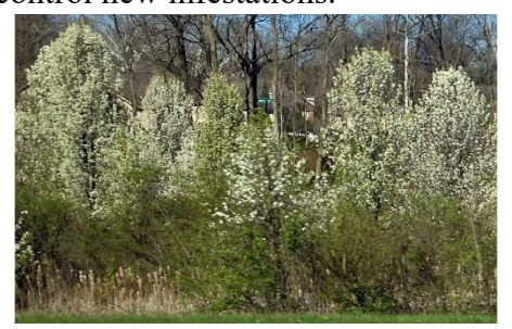
Callery Pear Infestation

An additional concern was hay which was donated from various states and distributed throughout Nebraska. Hay could contain invasive plant seeds and new invasive plant infestations could develop from this vector. The NISC had many meeting presentations and conversations regarding invasive plant species in 2019 and management and research efforts to control them. The NISC discussed callery pear, which is a problematic ornamental tree species and will be providing outreach to industry and nurseries on other ornamental trees they can sell instead of the callery pear. The concern