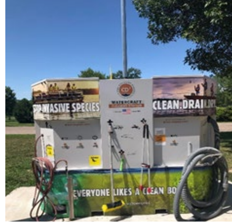
Watercraft Cleaning Unit at Lewis & Clark Lake

installed at Weigand marina on Lewis and Clark Lake in May 2019. The unit is free for the public to use to clean their watercrafts and equipment to prevent the spread of AIS. Lewis and Clark Lake is infested with zebra mussels and cleaning, draining and drying watercrafts and equipment before launching at another waterbody is key to prevent the spread of AIS. The Nebraska Game and Parks Commission (NGPC) conducted watercraft inspections and decontaminations to prevent the spread of AIS during the summer of 2019. A total of 2,843 watercraft inspection were completed. Less than 1% of the watercrafts that were inspected in 2019 had any risk factors which shows the majority of boaters cleaned, drained and dried their watercrafts which is very encouraging as those steps prevent the spread of AIS. 2019 was the first year Nebraska used the Western Regional Watercraft Inspection and Decontamination (WID) data sharing system to share results of