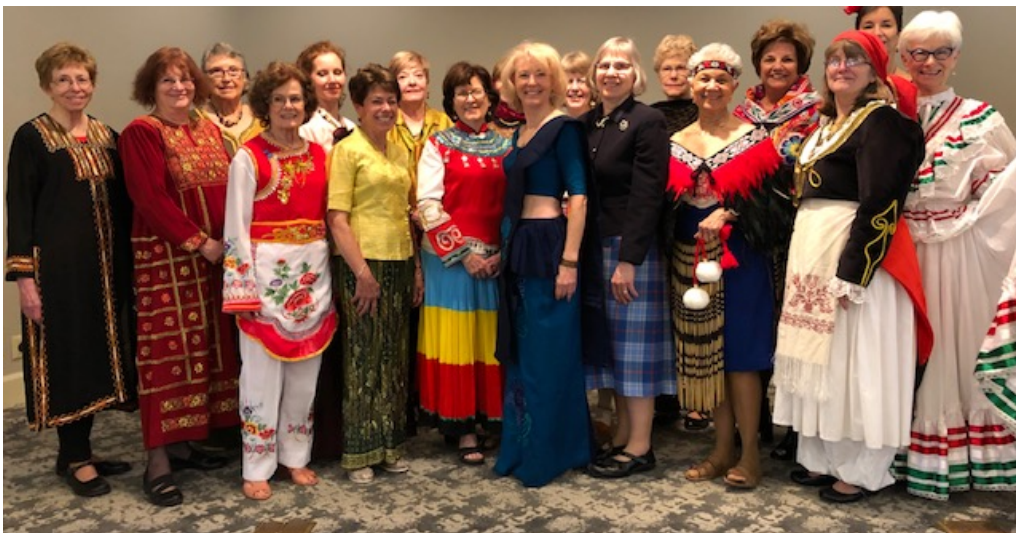
Spring Luncheon and Style Show – Around the World in 80 Days