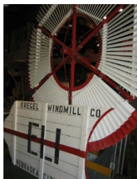
Kregel Windmill Museum

Tour includes visit to Arbor Lodge, lunch at The Keeping Room, choice of one museum - Kregel Windmill Museum, Fire Fighters Museum or Civil War Veterans Museum, and Kimmel Orchard