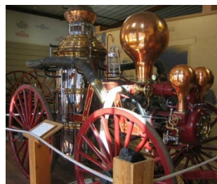
Fire Fighters Museum