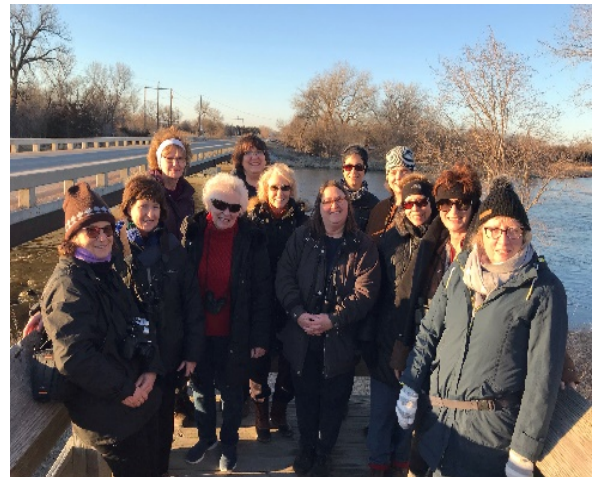
Trip to see the cranes near Kearney