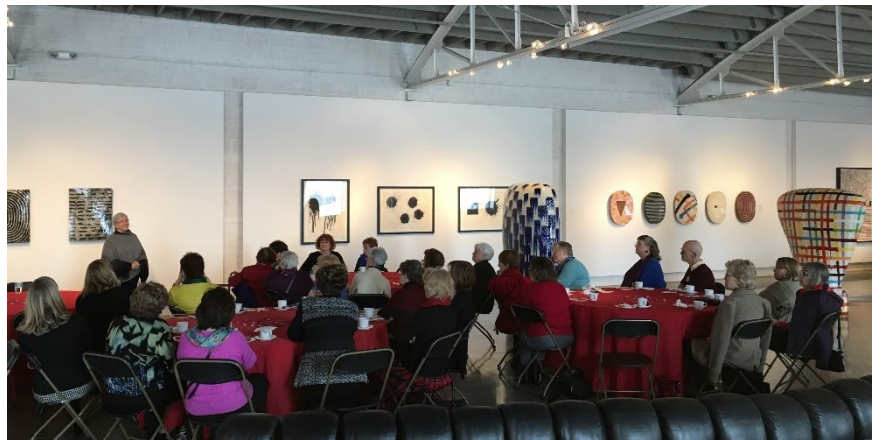
Fundraiser at the Assemblage featuring the works of Jun Kaneko