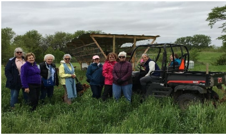
Variety Club visits Olive Creek Farm