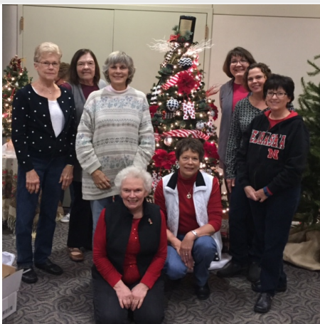
UNLWC tree decorated by members for this year’s Heritage League “Holiday of Trees” event.