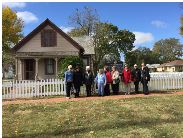
UNLWC members at the Fall Tour in front of Willa Cather's childhood home