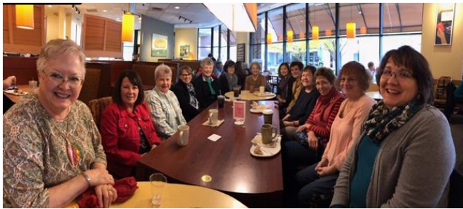
Newcomers and Friends coffee at Panera Bread