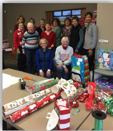
Variety Club members wrap gifts for Home Instead's Be a Santa to a Senior service project

Members who have passed away since the Fall 2018 newsletter