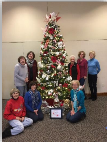
Decorators of the UNLWC Christmas tree at the Holiday of Trees event