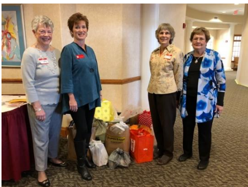
Donations for the Huskers Helping Huskers Pantry