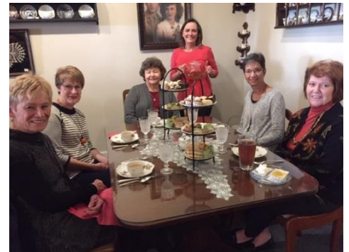
Variety Club at the Treasure Trove Tea Room