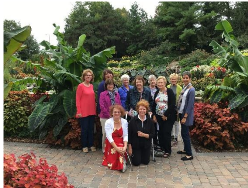
Variety Club tours the Sunken Gardens