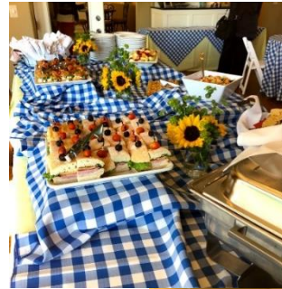
Fall Welcome Event

A formal invitation will be mailed to each Interest Group Chairperson.