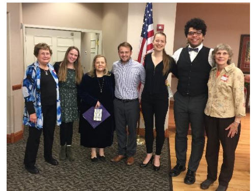
Entertainment by students of the UNL Music Department