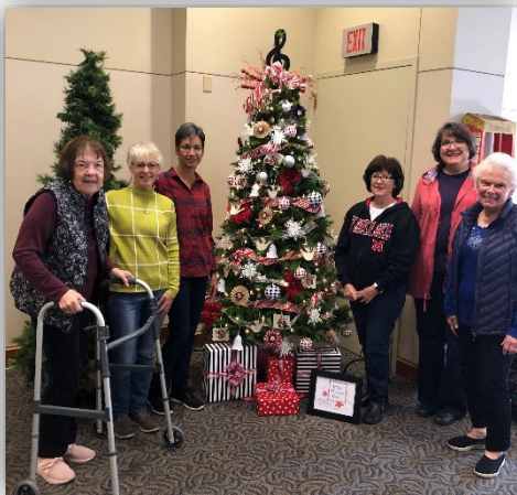
Decorators of the UNLWC Christmas tree at the Holiday of Trees