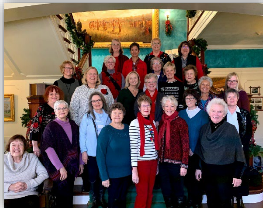
Variety Club enjoyed a Holiday Tea at Arbor Lodge